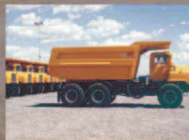
35 TON ROCK BODY